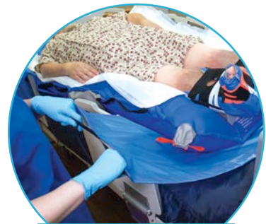
LOW-FRICTION GLIDE SHEET