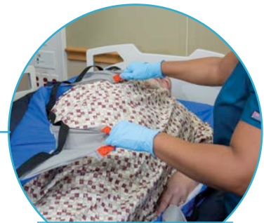
EASY ROLL HANDLES