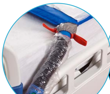
HOSE PROTECTION SLEEVE

Boosting and repositioning patients in bed is a high-frequency task. The Prevalon AirTAP XXL System helps reduce the risk of injury to nurses and other caregivers by providing an ergonomically friendly method of turning and repositioning larger patients.