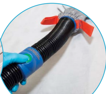
POINT OF CARE POWER SWITCH